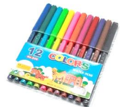
Coloured markers (for children only)