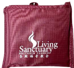
Recyclable Shopping Bag